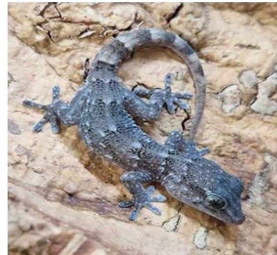
Boettgers wall Gecko