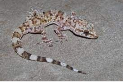
European House gecko