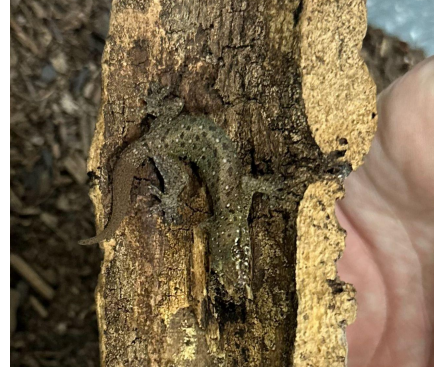
Four clawed House Gecko