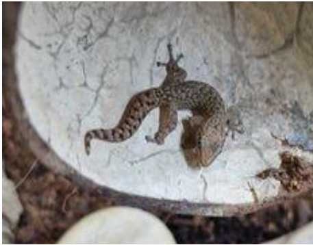
Afroedura (African Gecko)